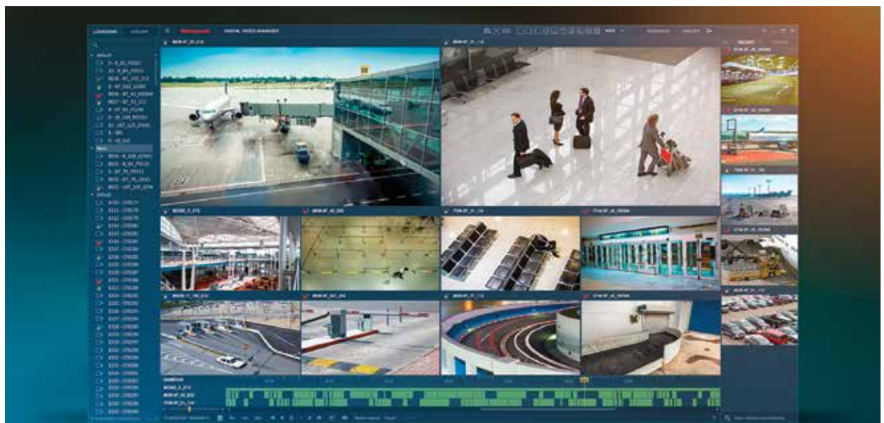
Honeywell Digital Video Manager Console