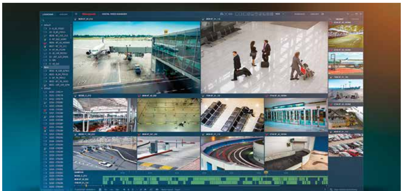
Honeywell Digital Video Manager Console